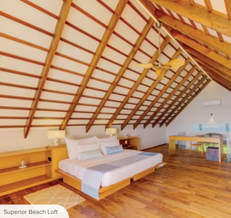
Superior Beach Loft