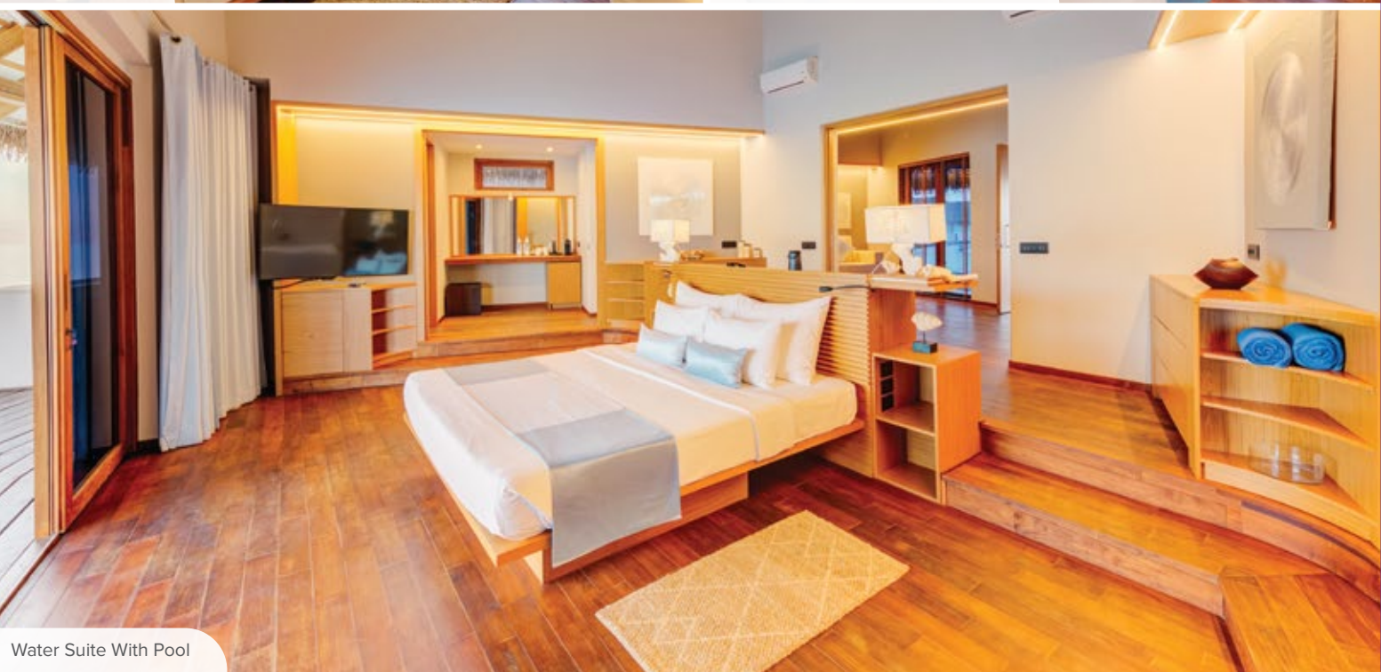
Water Suite With Pool